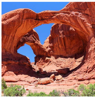
Stunning rock formations!