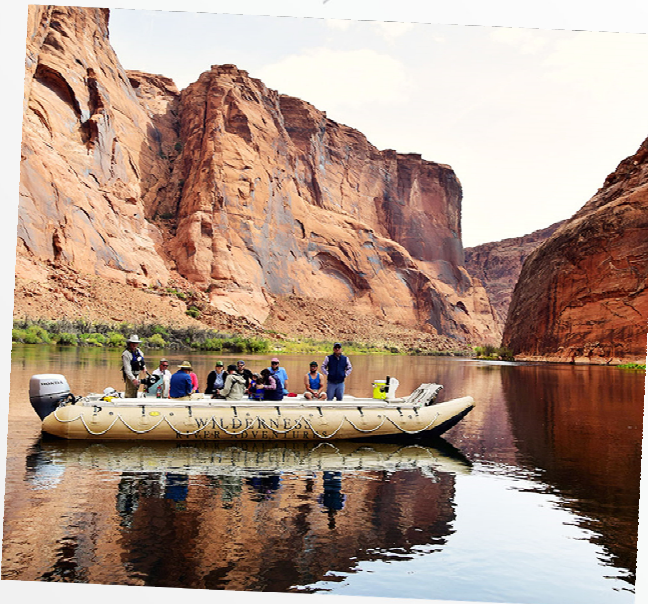
Leisurely river float!

Due to light pollution, 90% of the world's population is unable to see the night sky in all its majestic beauty. At Arches , you can see the Milky Way galaxy as our ancestors experienced it thousands of years of ago!